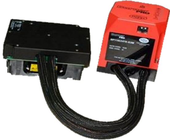
60-2991-1 Wiring Base Adapter

The easiest method available for converting a Honeywell RM7800/RM7840 type E, G, L or M control to a BurnerPRO is to use Fireeye part number 60-2991-1. This is an adapter that connects directly to the Honeywell 7800 SERIES wiring base and includes a tethered BurnerPRO wiring base. By default, this wiring base is attached to the adapter but has long enough wire connections to allow alternate placement beside the Honeywell wiring base adapter, as space permits.