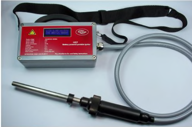
Model: With exchangeable ignition electrode, (Shown with optional retaining ring)