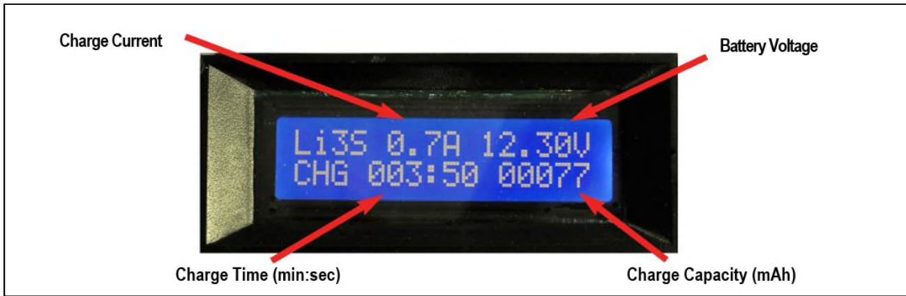
FIGURE 1. DISPLAY

After extensive use (in excess of 5000 sparks) the electrode may also require to be changed, with a replacement available from Fireye.