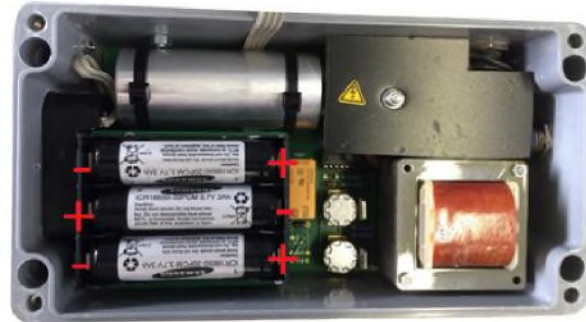
3 units of 3000mAh ICR18650 3.7V Li-ion