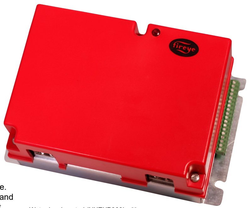
Water level control (NXEXP300) with optional daughterboard (NSDBWLC) installed

The optional daughterboard (NSDBWLC) expands the basic water level control to include measurement and control of boiler total dissolved solids (TDS) using industry standard TDS probes<sup>3</sup>. The daughterboard has inputs for the TDS probe as well as an RTD (PT100) type boiler temperature sensor. If no sensor is available, the daughterboard relies on the standard saturated steam table in its memory. The total dissolved solids are controlled by surface and/or bottom blow down. A full-range of options allows flexibility to meet most boiler requirements.