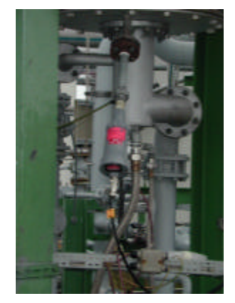
(Lower Flame Scanner)

OXENO recently installed two of the Fireye latest technology, Insight flame scanners on their plant in Marl Germany. The Insight scanners (95DSS1E-1) are a fully integrated design providing all the functionality of detection, amplification and signaling in a true "one piece" system. Insight equipment and full technical support was provided by the local Fireye distributor based in Düsseldorf). The fuel fired at OXENO comprises some fifty different types of process gases from emptying of tankers trucks and gas holders.