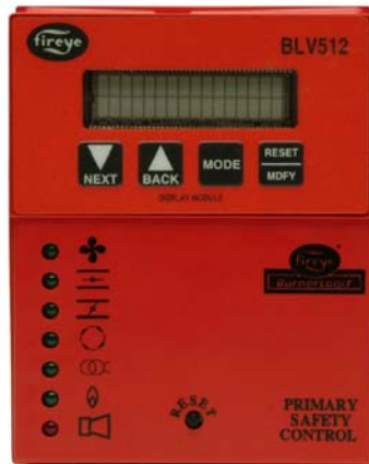
FRONT VIEW ( WITH OPTIONAL DISPLAY INSTALLED )

120 VAC, 50/60 Hz YB110UV YB110UVSC YB110IR YB110FR YB110DC