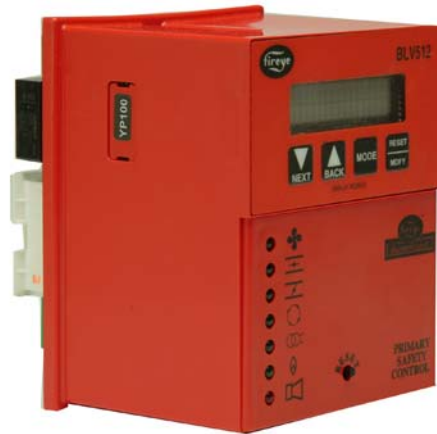
SIDE VIEW ( WITH OPTIONAL PROGRAMMER AND DISPLAY INSTALLED )